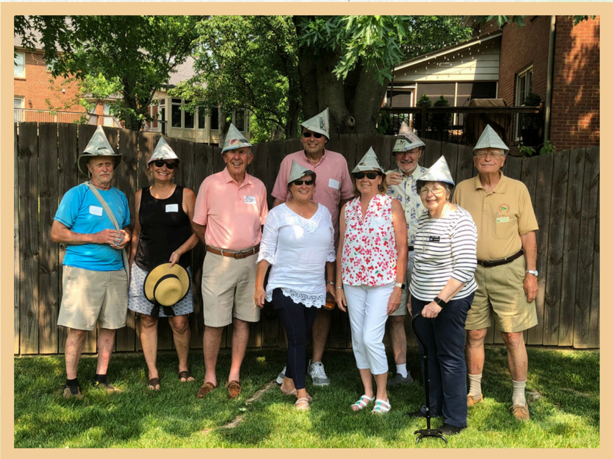
Commodores at Tea 2023

Please RSVP to socialdirector@caverunsailing.org