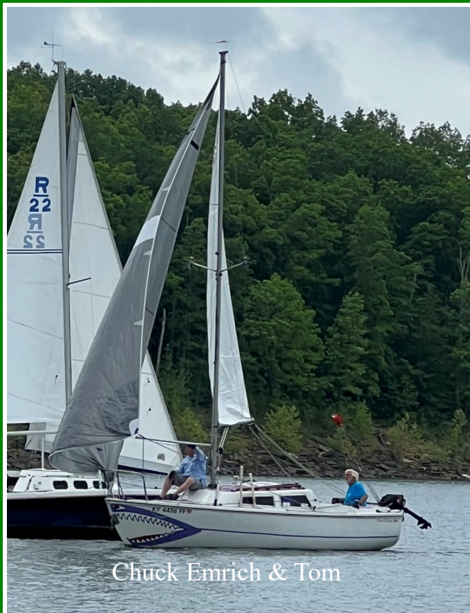
Chuck Emrich & Tom