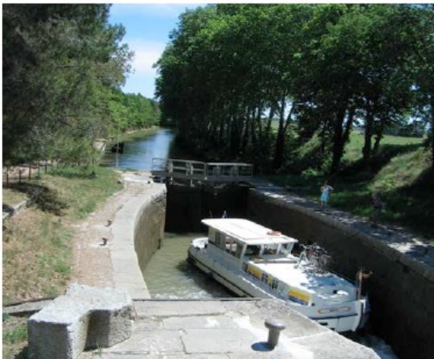
Sometimes the passages through the locks would be a little tight.