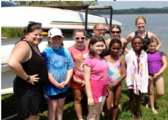
Girl Scout Sailing camp participants in the sailing intensive sessions and two of the camp counselors.