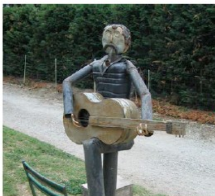
A lock operator and his wife made sculptures visible from the canal which were for sale. No one on the trip purchased any.