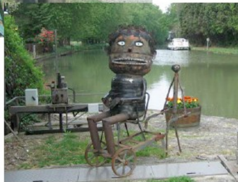
Round trip was somewhere between 80 and 100 miles. Favorite villages/towns were Trebes which was picturesque and the cab drivers helped carry groceries to the boat and Carcassone which is a walled city with a cathedral that happened to have a choir singing when the group visited AND had someone looking like Keith Richards in the market.