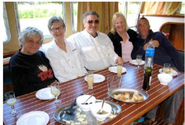
Meals aboard the canal boat were not too different from those aboard cruising sailboats.