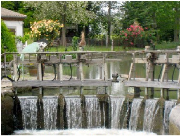
Along the way locks allowed the boat to move comfortably from one level to another.