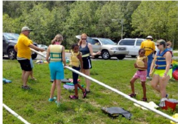
At the end of every session the girl scouts took down the rigging and put away the boats.