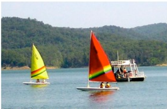
By the end of the week pairs of girl scouts were taking the boats out by themselves. By the end of the last day four out of five pairs capsized and righted successfully.