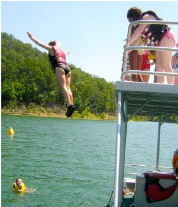
One of the girl scouts did Olympic Style jumping off of the top deck of the MMII. They all loved it.