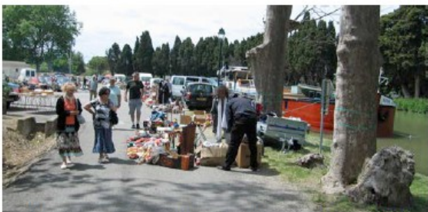
On the weekends a street fair/flea market would occasionally pop up along the canals.

Stops at the local markets along the way provided fresh and delicious foods for meals and snacks.