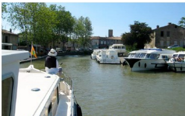
On occasion the canal became a bit crowded.