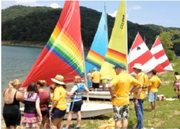
Five boats were used for the training classes.