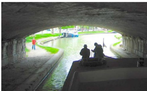
Canals ALWAYS go UNDER highways.