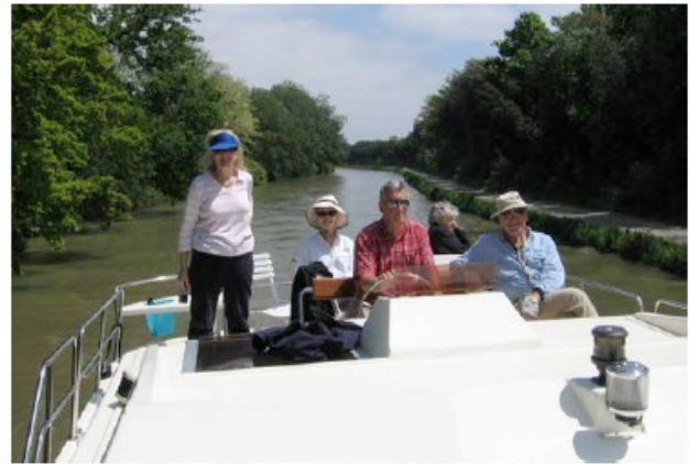
The weather in May was usually very nice and sitting on the top of the boat deck was the place to be.