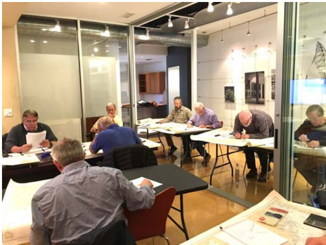
ASA 105 Students working hard on their course.