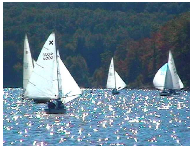
The picture above is from a late 90's Grand Annual Regatta and taken with an early digital camera.