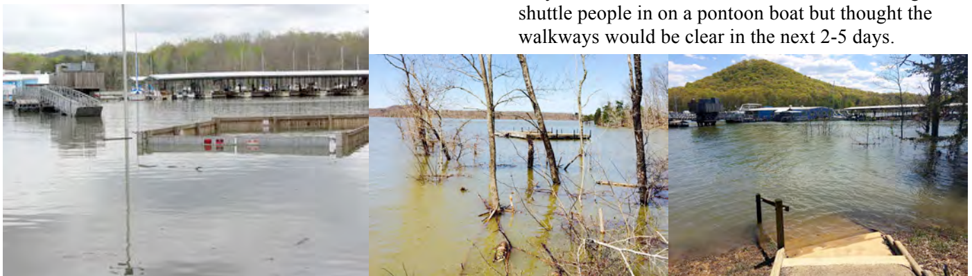
Left: High water nearly covered the wall around the refuse bins. Center: The dock next to the Scott Creek Boat Ramp is in deep water. Right: The walkway from the parking lot to the marina is at water's edge.

The record high water (30 ft above summer pool) that hit Cave Run Lake about the middle of April is down to about 20 feet above the summer pool as of May 12 th . The Cave Run Marina was still having to shuttle people in on a pontoon boat but thought the walkways would be clear in the next 2-5 days.