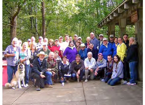
Theta Nu members and CRSA captains and crew at the 2015 Bluegrass Charity Regatta.

Please PRE-REGISTER using the forms enclosed in this newsletter (good) OR look for registration forms on our caverunsailing.org website (good too) OR register on site (not as good as pre-registering but certainly OK).