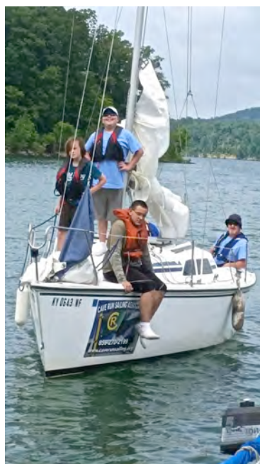
Preparing for docking was one of the many maneuvers the Boy Scouts learned in their small boat merit badge instruction.