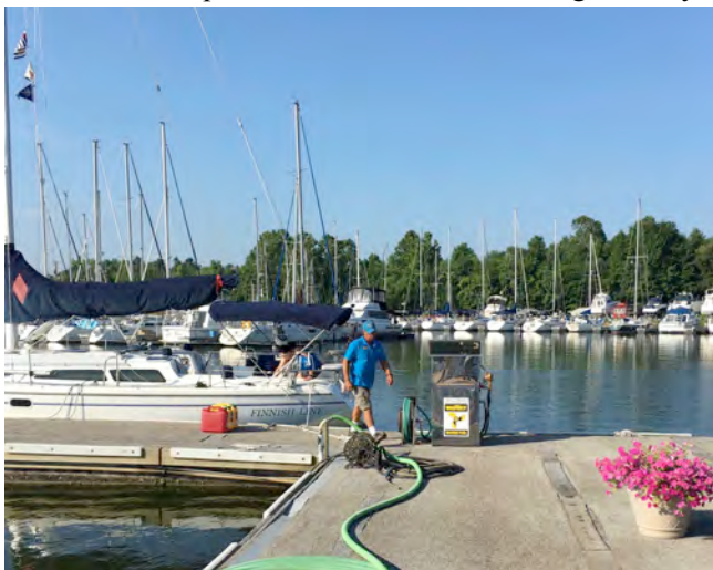
Picking up fuel at Green Turtle Bay prior to departure.

Finnish Line uses about 0.8 gallons of fuel per hour At 2500 RPM speed will average 5.5 - 6.5 knots depending on current and sea state. It was unlikely that here would be opportunities to hoist sail. Though there were adequate locations to refuel along the way