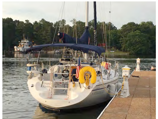
Finnish Line docked at Paris Landing. Note the USCG vessel in the background.

distance we motored 46 miles to Paris Landing Marina near Buchanan Tennessee. This is the home of Pais Landing State Park with a beautiful lodge overlooking the Lake. The staff is about the most customer friendly you could find anywhere. The Park ranger will transport boaters to the lodge for an excellent buffet and make sure you get back to your boat after dinner. Everything is neat and clean. Transient dockage rates