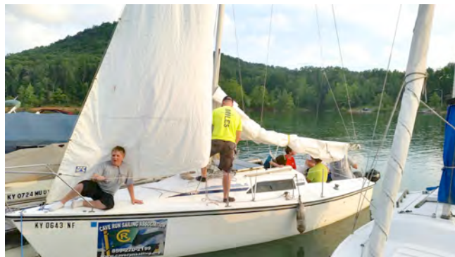
Coming into dock to change crew.