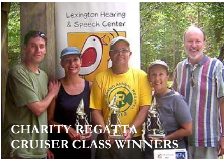
CHARITY REGATTA CRUISER CLASS WINNERS