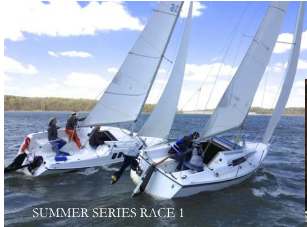
SUMMER SERIES RACE 1