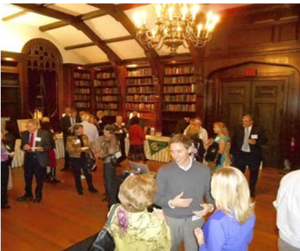
AWARDS BANQUET RECEPTION