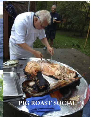
PIG ROAST SOCIAL