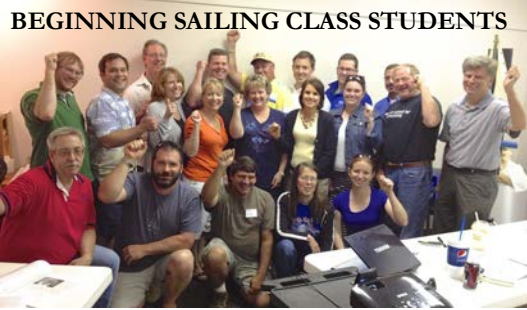
BEGINNING SAILING CLASS STUDENTS