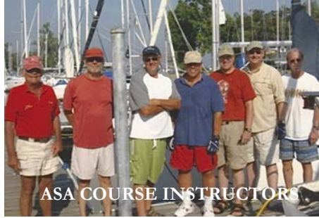
ASA COURSE INSTRUCTORS