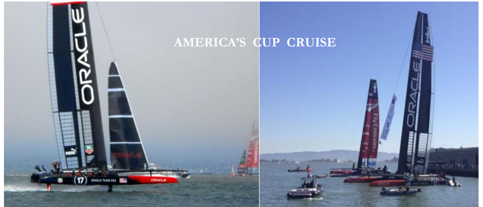
AMERICA'S CUP CRUISE